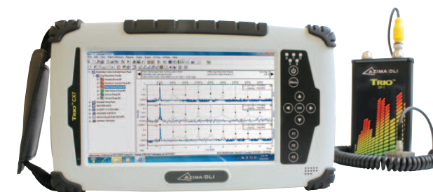
TRIO CX7 tablet, data processor and triaxial vibration sensor

TRIO™ has arrived and is demonstrating that there is a better way to implement machine condition monitoring. TRIO is more than a vibration data collector; it is a powerful computerized system in a mobile industrial package that sets aside the traditional data collection model and brings forth a new focus on ergonomics, efficiency and safety. TRIO will improve the effectiveness of your condition monitoring program and will allow you to get more done in less time with a high degree of success while lowering the overall cost of your program.