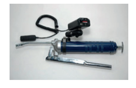
UP-201: UP-201: ULTRASONIC GREASE CADDY Prevents over lubrication. Provides visual and audible indication for proper lubrication.