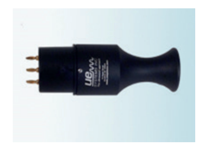
CFM-9/10: CLOSE FOCUS MODULE A specialized module to help locate LOW LEVEL pressure and vacuum leaks.

EXC-9/10: MODULE INTERCONNECTION CABLE Shielded cable, works with either module for hard to reach areas. Standard length: 8' (2.4M). Lengths up to 50 ft. are available.