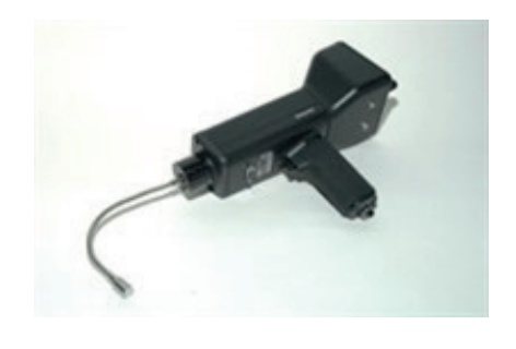
FSM-9/10: FLEXIBLE SCANNING MODULE Bend this probe to odd angles to locate sound sources in hard to reach areas.

UWC-9/10: ULTRASONIC WAVE FORM CONCENTRATOR (PARABOLIC DISH) The UWC doubles the detection range of standard scanning modules and pinpoints ultrasonic leaks & electric emissions at great distances.