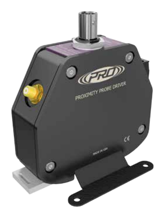
Panel Mount Option (Shown Above)