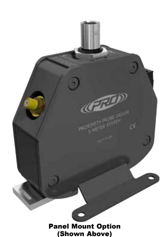
TERMINAL BLOCK WIRING