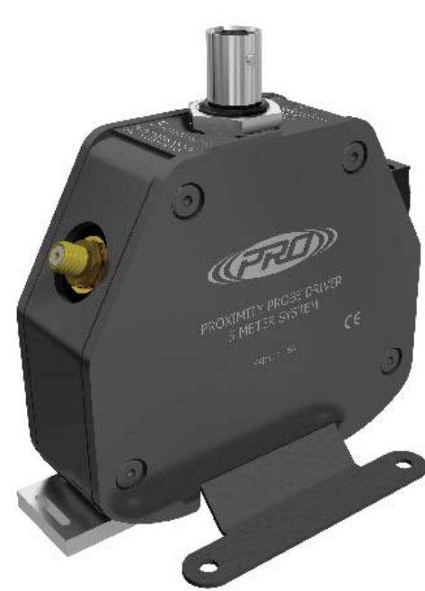
Panel Mount Option (Shown Above)