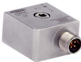
AC230-1D Triaxial sensor

Triaxial sensors are offered by many manufacturers. CTC's offerings include the following sensor series: AC230 and AC115.