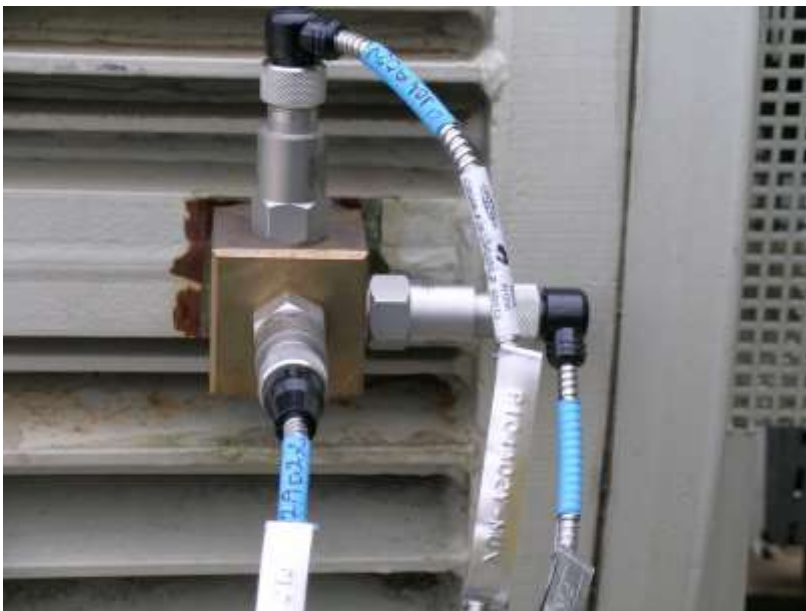
Figure 4. Measurement point on a rotating machine

One of the most important task of the project was the development of Risk Analyzer software, what can classify the risk of rotating machines, which is under off-line or on-line surveillance by diagnostic systems. The next figure shows the risk matrix with the probability and the consequence variables.