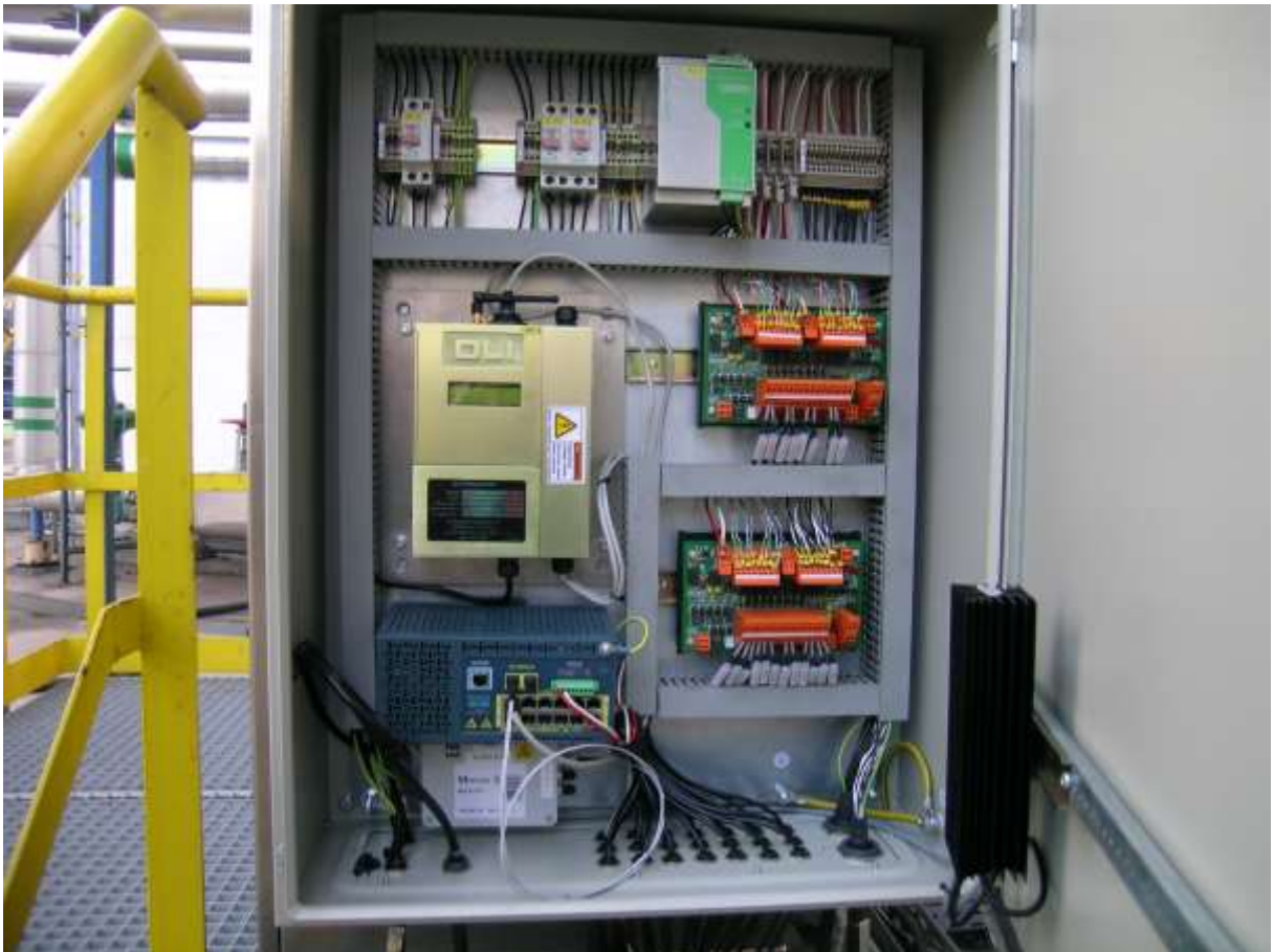
Figure 1. SpriteMax on-line monitoring computer and two MUX-es in an electric case

The next photo shows a SpriteMax unit and two multiplexers placed into a usual IP-67 case in an explosion proof environment.