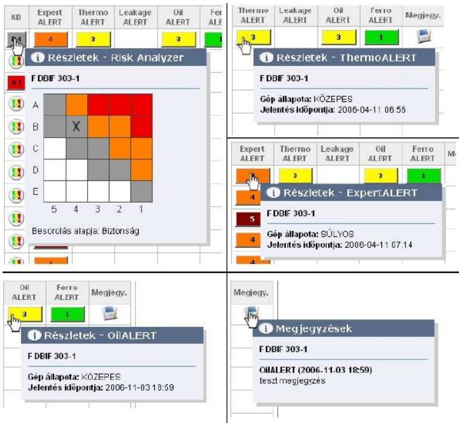
Figure 5. The Risk Analyzer; risk matrix of rotating machines

You can see the schema of the integrated diagnostic system on the next figure. Each software has its own database. The expert systems communicate with ExpertALERT receiving for further use the results of automatic analysis. All results of expert analysis created by ExpertALERT, ThermoALERT, OilALERT, FerroALERT and LeakageALERT are displayed in BDES (Board of Diagnostic Expert Systems) software as well as the result of risk qualification of machine pinpointed by Risk Analyzer software.