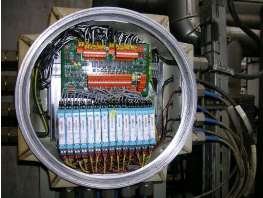
Figure 2. TMUX unit placed to the explosion dangerous environment

The next figure shows a TMUX unit, which is a multiplexer in a pressurized box with IS barriers in each signal channels. This product can be placed in the explosion dangerous areas. It was tested and positively qualified by the Hungarian Authority BKI to work in higher environmental temperature than -35\text{ }^{\circ}\text{C} . It has electric heating starting to heat the box under -15\text{ }^{\circ}\text{C} .