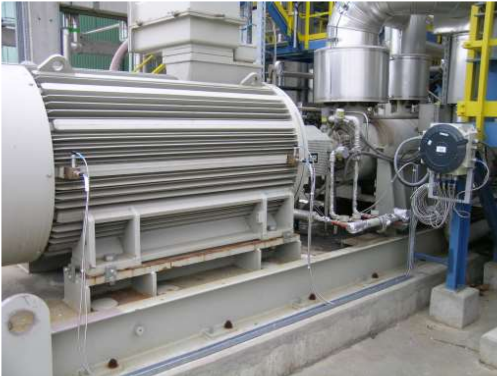
Figure 3. Rotating machine with measurement point and TMUX unit The next photo shows one pickup point with three IS accelerometers.