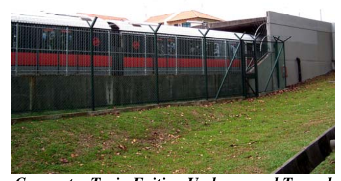
Commuter Train Exiting Underground Tunnel

The worlds developing infrastructure creates many technical challenges for engineering and construction. Quite often names like "Chunnel" (English Channel), "Big Dig" (Boston), and "Nam Wan" (Hong Kong) are feats to marvel at as they provide passages underground, underwater, or straight through a mountain for today's highways and rapid transit systems.