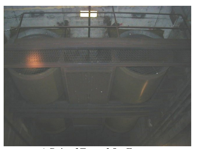
A Pair of Tunnel Jet Fans

Purging of toxic gases with a supply of clean air requires Tunnel Jet Fans. These fans provide longitudinal ventilation of the tunnel and are the primary sources of clean air. Jet fans provide a very high impulse or thrust of clean air into the tunnel and through the tunnel. They are often found in multiple sets mounted on the roof or side wall of the tunnel at selected intervals. The number of fans required is based on tunnel length and design.