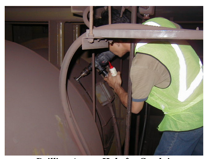
Drilling Access Hole for Conduit

Cable management is also a concern with tunnel fans. Quite often there is a significant amount of air flow and long distances involved from the sensors to the transmitters, or directly to the control room in the case of dual output sensors. Care must be taken and plans put in place to assure that the cables are run in a manner that protects them. Access holes and conduit pipes may be required to protect the cables.