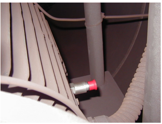
Horizontal Vibration Sensor Mounted on Tunnel Fan Motor