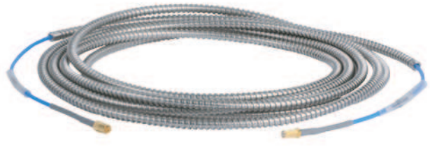
Armored Cable Shown