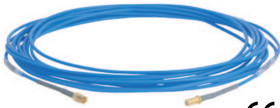
Standard Cable Shown