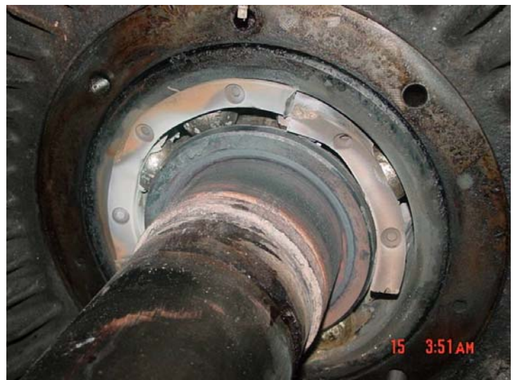
Failed Motor Bearing Don't Let This Happen To Your Machines !