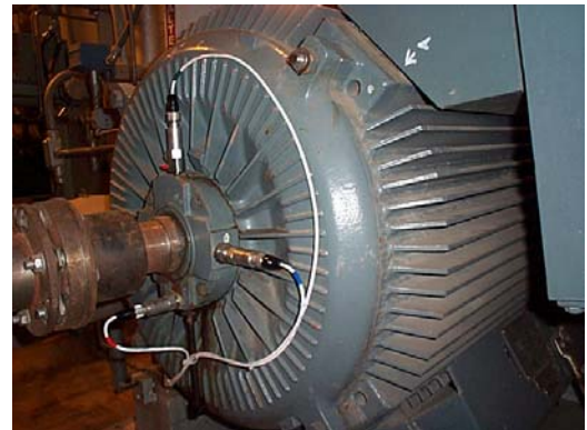
Measuring Motor Bearing Vibration

Typical machines include motors, pumps, fans, gear boxes, compressors, turbines, conveyors, rollers, engines, and machine tools that have rotational elements.