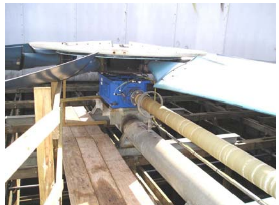
Monitoring Cooling Tower Vibration