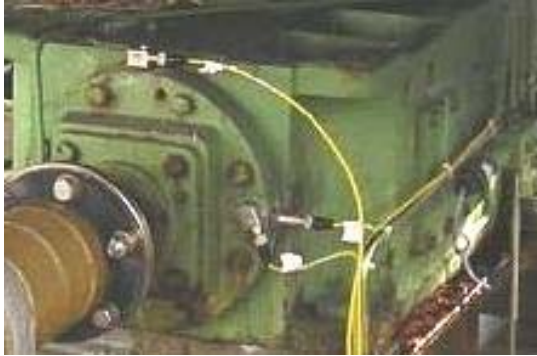
Accelerometers on a Gear Box

The practice of Vibration Analysis does require the measurement and analysis of rotating machines utilizing different vibration sensors (accelerometers, velocity transducers, or displacement probes). The most common sensor used in industry is the accelerometer.