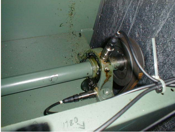
Loop Power Sensors to Monitor Bearing Vibration

not a dynamic analog signal, and it can not be used to analyze the machine fault, but it can be used to alarm the machine and indicate when vibration levels are too high.