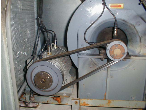
Monitoring Motor & Fan Vibrations

The measurement and analysis of dynamic vibration involves accelerometers to measure the vibration, and a data collector or dynamic signal analyzer to collect the data. Analysis is usually completed by a technician or engineer trained in the field of rotating machinery vibration.