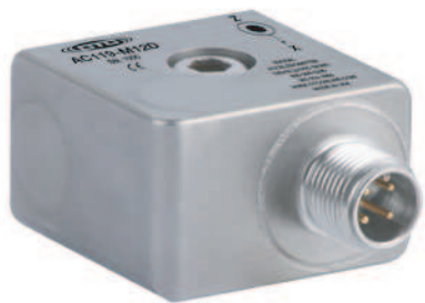
Actual Product Size Shown