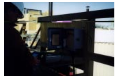
Figure 8. Accessing data from the switch box