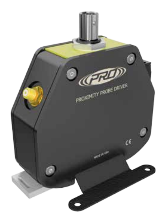
Panel Mount Option (Shown Above)