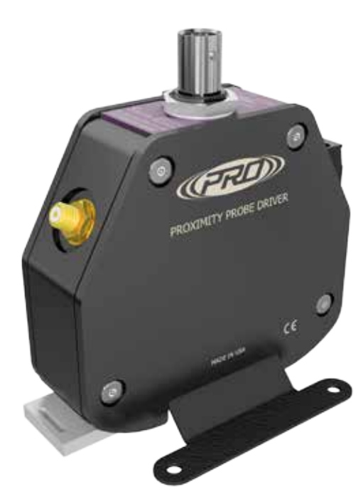
Panel Mount Option (Shown Above)