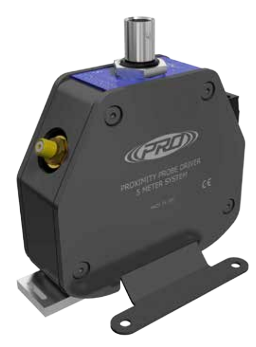
Panel Mount Option (Shown Above)