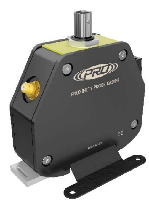
Panel Mount Option (Shown Above)