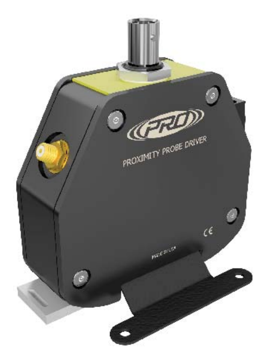
Panel Mount Option (Shown Above)