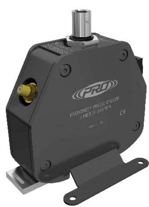
Panel Mount Option (Shown Above)